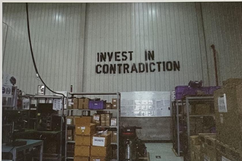
马永锋 / Ma Yongfeng, 新“大字报”系列 / Invest in Contradiction , 2011